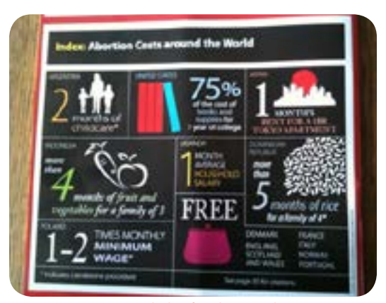
From: Conscience, Catholics for Choice, Vol 34, No 3, 2013, infographic posted on the listserve, March 2014

Specific examples of reports of Campaign members' activities, or of events that led to new activites, that were carried on the listserve in December 2014 are the following: